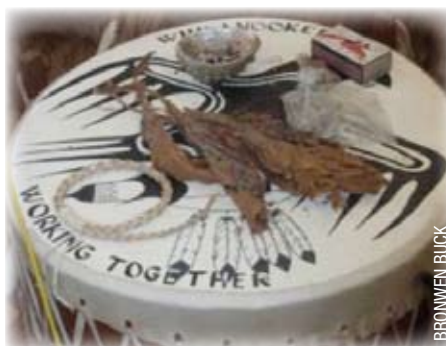
Text on a drum in the Band Office at the Chippewas of the Thames First Nation emphasizes the value of collaboration – a principle the CAP process upholds.