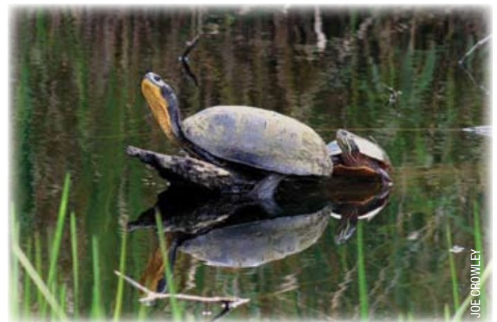
Blanding's Turtle and Painted Turtle

For more information, or to learn how to participate, visit: www.longpointlandtrust.ca .