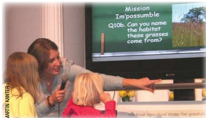
Eager children tackle 'Mission Im'possible', the toughest category of questions in our game show.