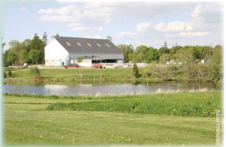
Naturalization around a pond at Onondaga Farms

Conservation programs at Onondaga Farms reflect the diversity of conservation challenges facing nature in Brant County and the Carolinian zone, including wetland restoration, tallgrass prairie restoration, reforestation and tree planting, the construction of bird nesting boxes, and the reintroduction of rare species. As well, Onondaga Farms is playing a central role as it attempts to reintroduce disease-resistant strains of the once mighty American Chestnut tree. Conservation efforts like those at Onondaga Farms offer us real hope that species like the American chestnut will not only be remembered, but will once again thrive in the Carolinian zone.