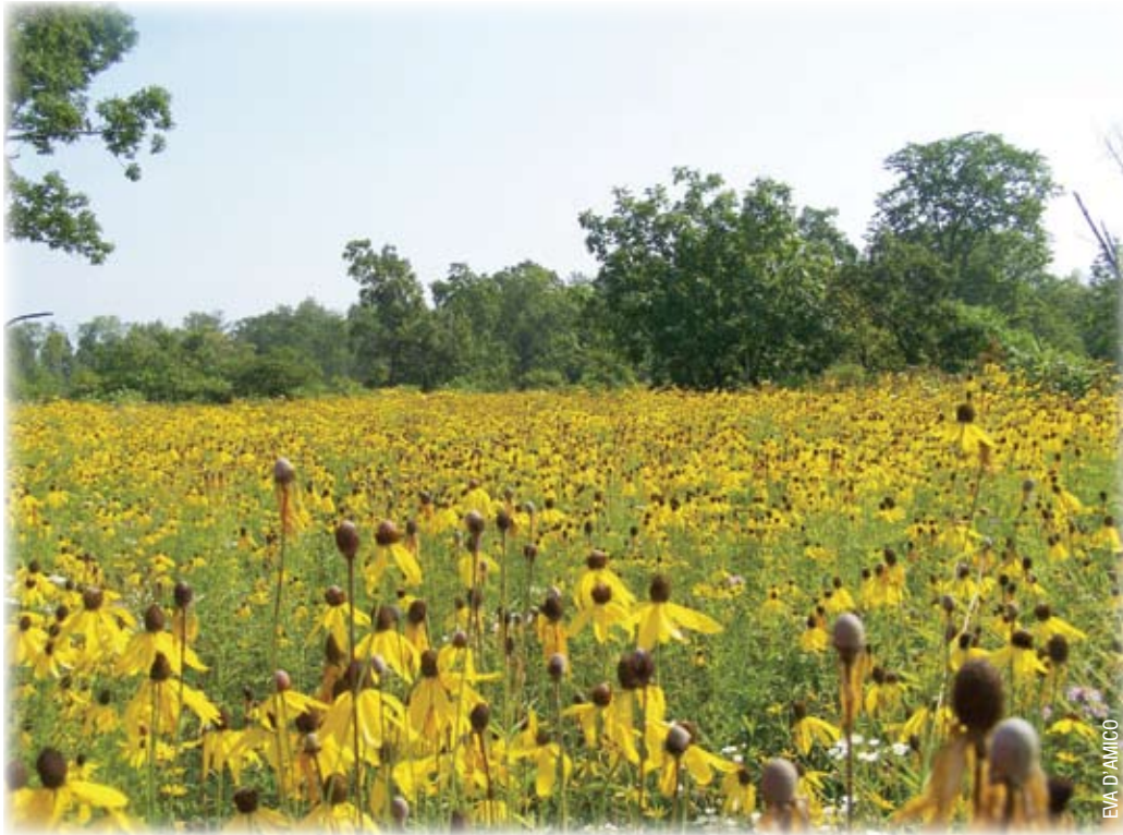
My adventure on Pelee Island included completing volunteer work on the Stone Road Alvar

Most naturalists describe their wonder at being on Pelee Island during the height of migration season. It is a well-known birding destination because it provides a stopover for thousands of migrating birds annually. But what does Pelee offer if you are a plant and invertebrate enthusiast like me? I decided to find out by volunteering with Ontario Nature last July. Our destination was the Island's Stone Road Alvar, where we braved heat and insect bites to monitor butterflies and view wildflowers at their finest.